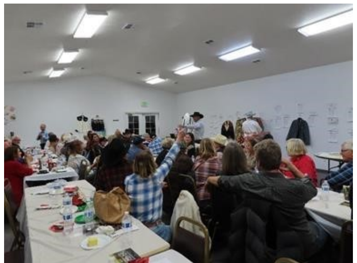
Me, Me, Me